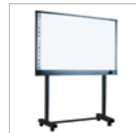
Mobile Adjustable Height Stand